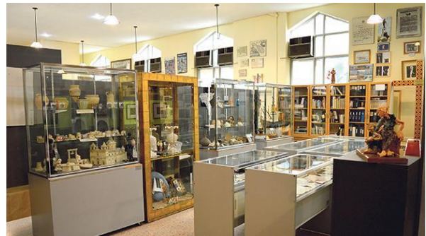
Interior View of the Maltese-Canadian Museum