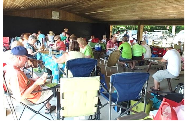
At the Picnic on July 7 th , Most Were Engaged in Playing Bingo in the Pavillion While a Few Played Bocci as Can Barely Be Seen to the Right

A picnic luncheon is planned for Wednesday, August 28 th at the pavilion in Weldon Park in Arva.